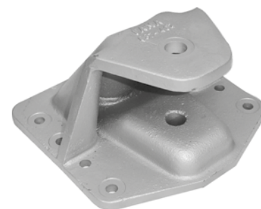
687.402 = SUPORTE DA MOLA TRAS. P/ DIANT. 12.170 A 16.220