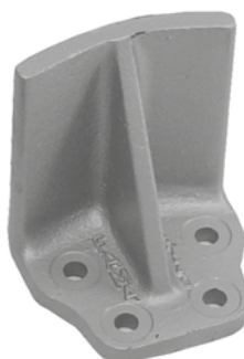
687.404 = SUPORTE DA MOLA AUXILIAR 12.170 A 16.220