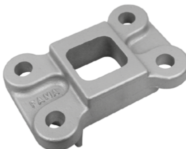
598.400 = SAPATA DE GRAMPO 12.170 A 16.220