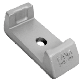
308.403 = ASSENTO FX. MOLA TRASEIRO 12.170 A 16.220