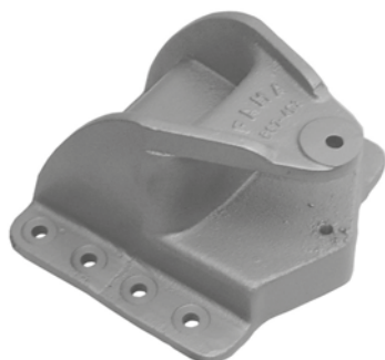
687.403 = SUPORTE DA MOLA TRAS. P/ TRAS. 12.170 A 16.220