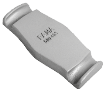
500.403 = GUIA GRAMPO TRAS. 12.170 A 16.220 N°. ORIG. (1.658.7817)