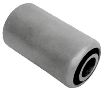
109.399 = BUCHA SILENCIOSA DIANTEIRA 12.170 A 16.220